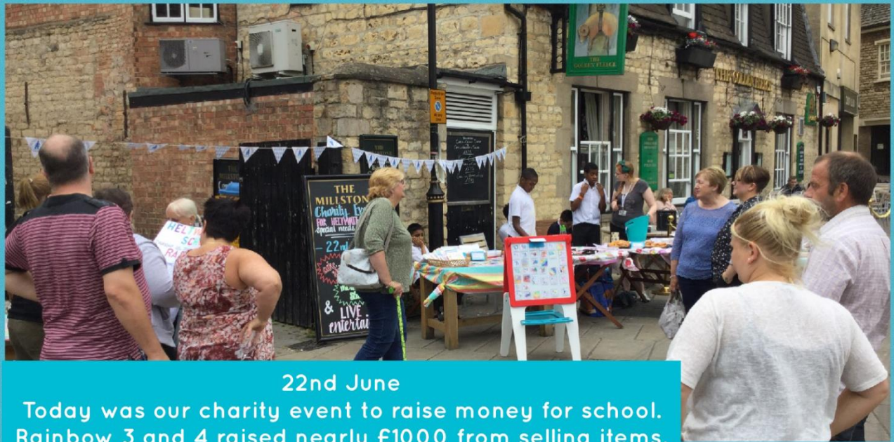
22nd June Today was our charity event to raise money for school. Rainbow 3 and 4 raised nearly £1000 from selling items, cakes and holding an awesome raffle. It was a great day out.